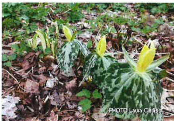
Flowering Trillium luteum in Clinton Co.